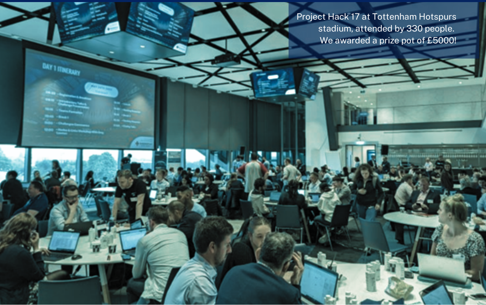
Project Hack 17 at Tottenham Hotspurs stadium, attended by 330 people. We awarded a prize pot of £5000!

By working together we can transform the industry at a pace and scale we have never imagined. Be part of the revolution in project delivery.