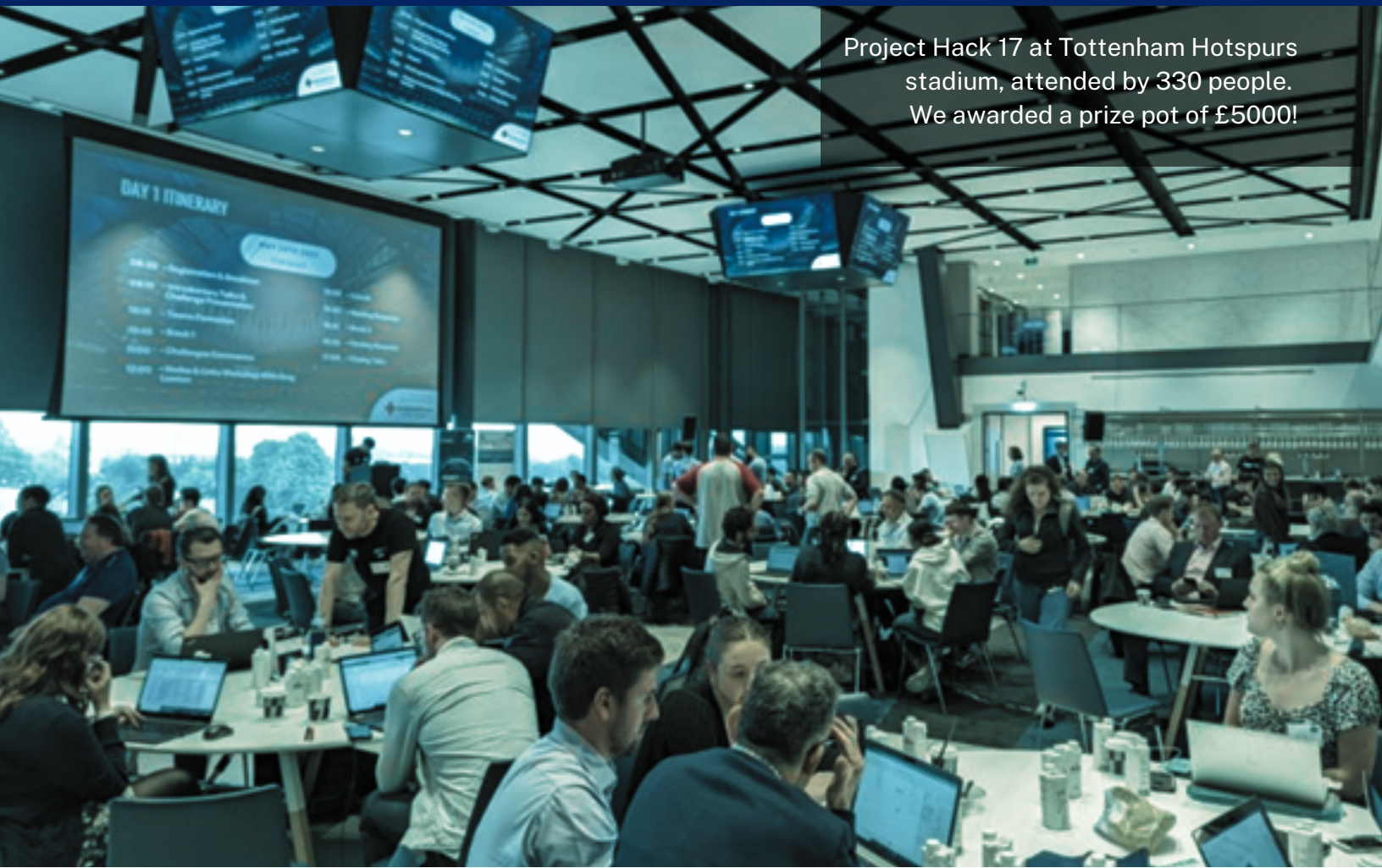
Project Hack 17 at Tottenham Hotspurs stadium, attended by 330 people. We awarded a prize pot of £5000!

By working together we can transform the industry at a pace and scale we have never imagined. Be part of the revolution in project delivery.